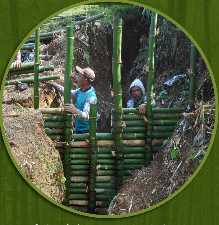
Bamboo gully plugs to prevent erosion and sedimentation, and to control gully development.

To demonstrate how to control gully erosion, the project built 35 erosion mitigation structures, ranging from small check dams, gully plugs and a head structure made of cemented stones, gabions and bamboo.