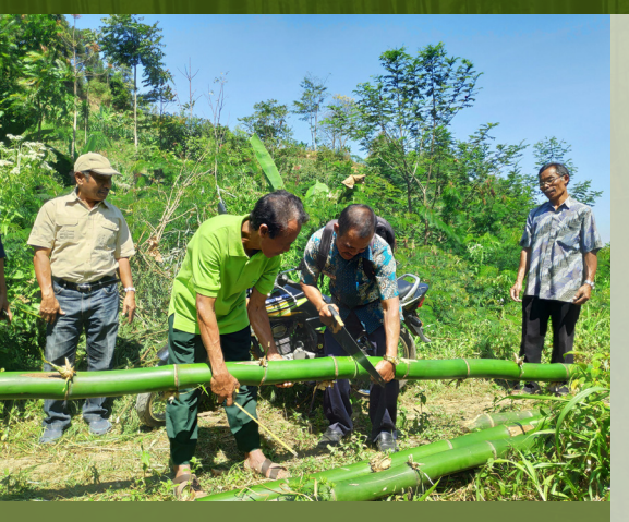
Demonstrating the use of bamboo to control gully erosion.

"Bamboo gully techniques can be disseminated to other communities because the technique is easy to imitate, and the material is easy to obtain at a low cost."