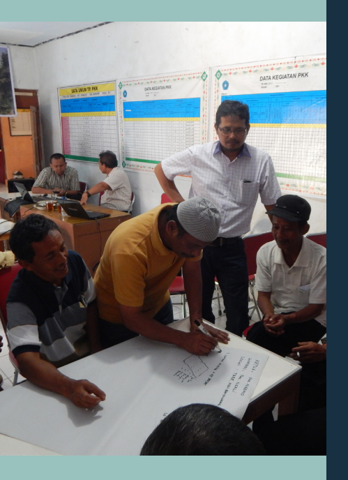
Developing participatory management plans with the local community