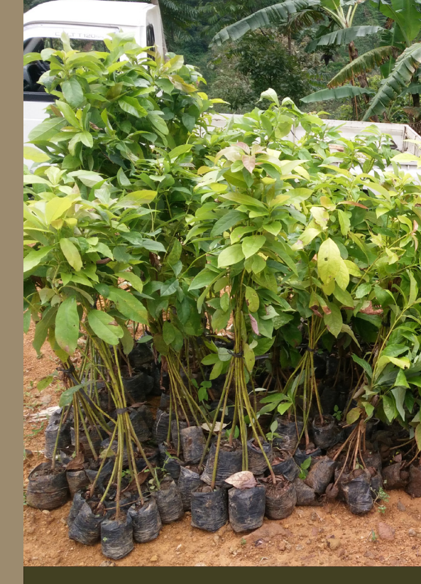
Agroforestry plant seedlings.

Different agroforestry models were established on 30 ha demonstration plots. Full perennial (woody) tree planting was usually applied to uncultivated areas while a mixed planting pattern of perennial trees (albizia, limpaga, and burflower) combined with seasonal crops (maize, cassava) or multi-purpose tree species (avocado, durian, mango) was applied on the cultivated area. Ginger, turmeric, cardamom, and some other herbs were also planted under the trees to diversify farmer incomes. Some families used the surjan system or strip planting to grow a range of crops in the same field where annual and perennial crops are planted alternately on the land with the same slope. All demonstration plots were located on the steep slope.